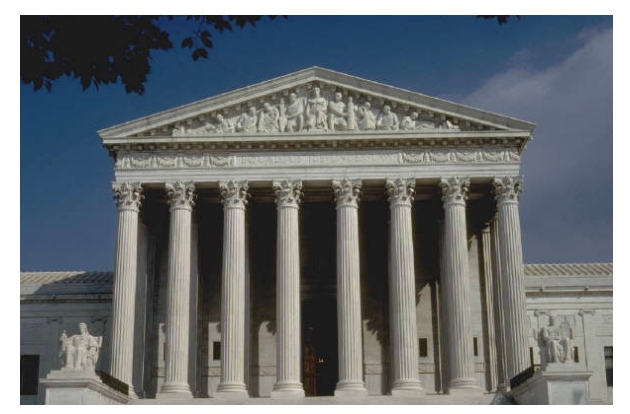
Contact us and we will provide a list of court judgements our expert witnesses have won for our clients.