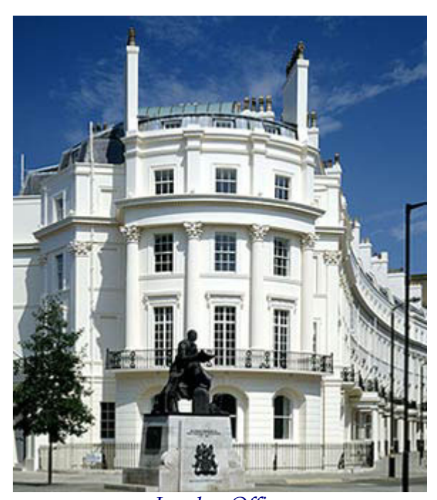
London Office No. 1, Grosvenor Crescent

We provide architectural, engineering, financial and management expertise for the construction industry. The Wheatley Companies (SM), together with our network of Strategic Partners, Wheatley Global Partners (SM), offer: