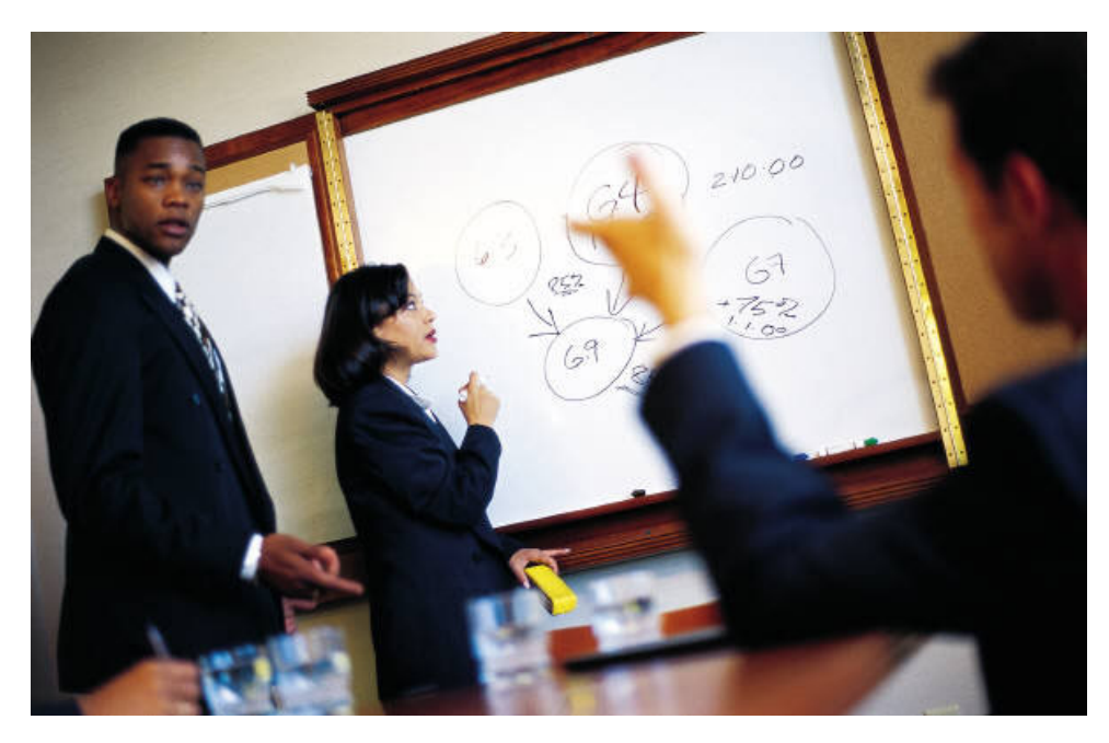
Our seminars help clients learn management skills that prevent project lailures.