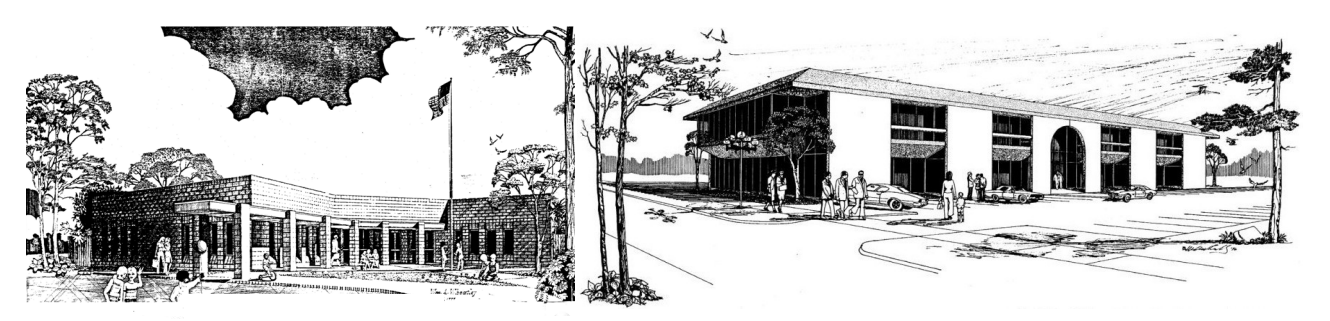
School Design by Wheatley

Architectural and WHEATLEY consultants have extensive architectural and engineering experience in the design of a number of project types. With design experience involving more than forty school projects in Texas, Pennsylvania and New Jersey, we are among the more experienced firms in the area of school design. We have designed university facilities as well, including biological research laboratories. Our experience in the design of research laboratory facilities and pharmaceutical pilot plants demonstrates our ability to perform projects with highly technical requirements. We have designed buildings for refinery projects, power plants, petrochemical plants, and military facilities as well, and we have headed design teams that included the process design for oil and gas, refinery, pharmaceutical, and industrial projects. Hospitals and clinics, office buildings, distribution centres, airports and recreational resort facilities all fall within our range of experience and capabilities.